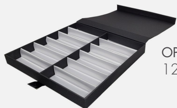
OPTICAL TRAY 12 slots