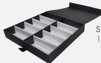
SUNGLASSES TRAY 10 slots